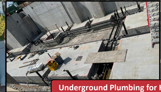
Underground Plumbing for Kitchen