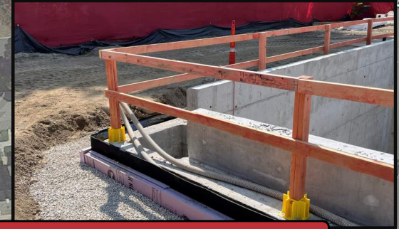
Foundation Wall Backfill Complete